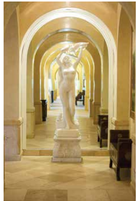
Artworks of all kinds can be found throughout the property.